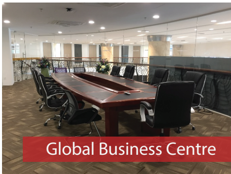
Global Business Centre