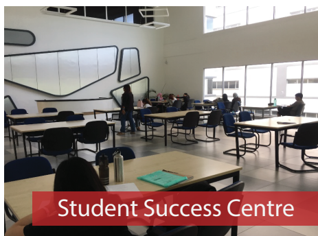
Student Success Centre